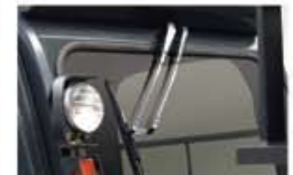
Climate controlled full cabin