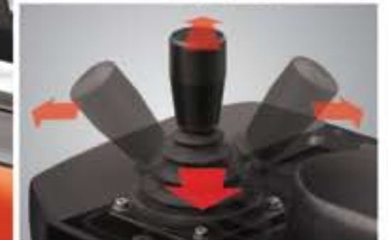
Joystick hydraulic control (optional)

An optional joystick control is available for lifting/lowering the forks and tilting the mast. An armrest attached to the seat provides optimum ergonomics for safe, efficient operations.