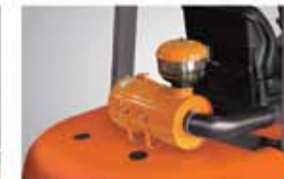
Pre-cleaner engine air intake