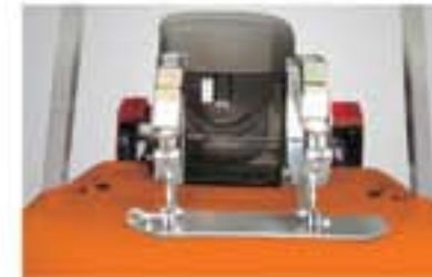
Swing-out LPG bracket