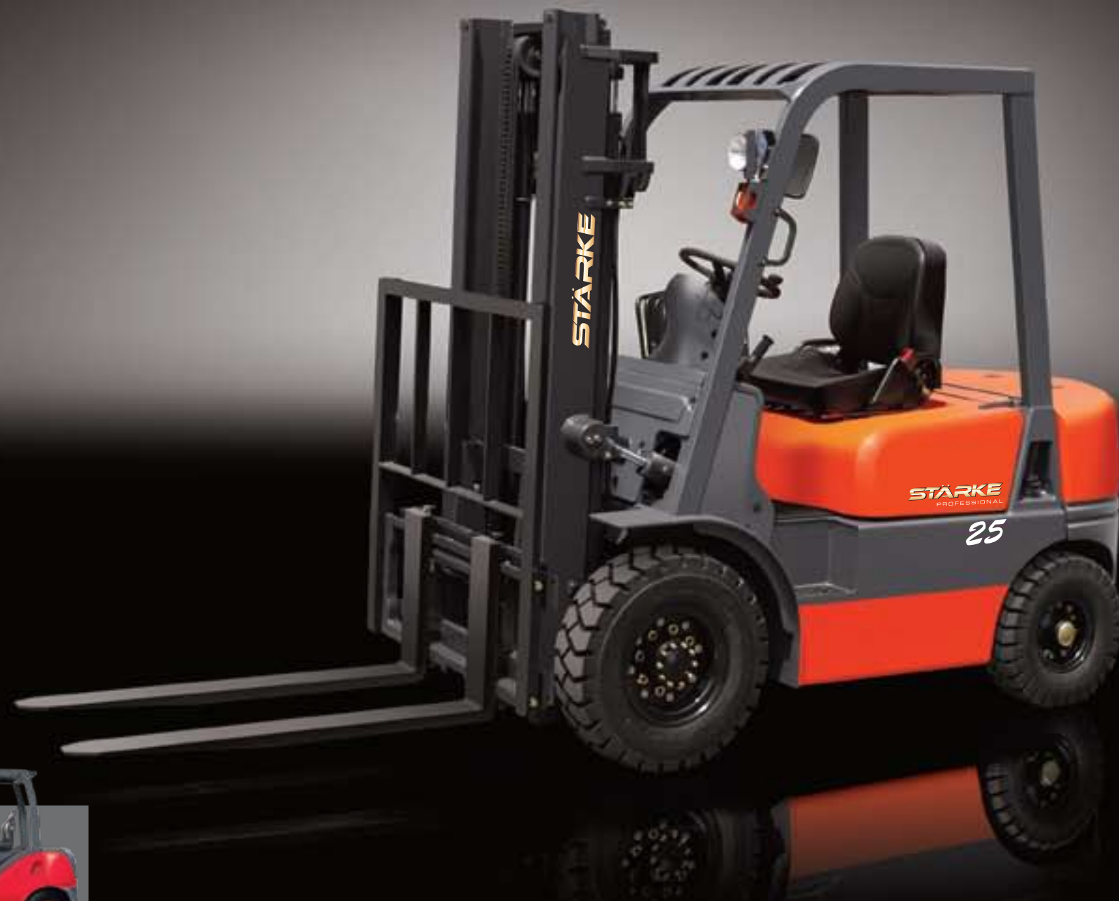
The Stärke Professional from the Stärke Materials Handling Group

Stärke is German for 'strong'. It perfectly describes how we perform in design, customer service, value, commitment to safety and to our products themselves... each is built for years of trouble-free service.