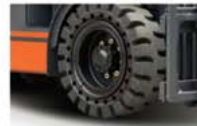
Super elastic tire