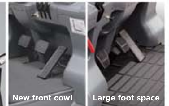
New front cowl

The Grammer suspension seat delivers the best in operator comfort, posture and performance. Ergonomically designed, it accommodates a wide range of operator weights with generous fore/aft, seat belt and seat angle adjustments.