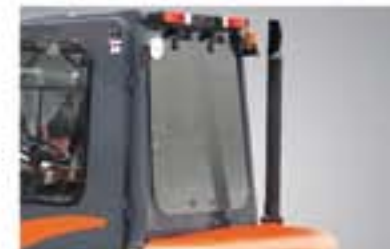
Upward exhaust pipe