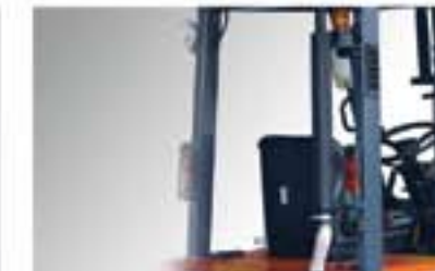
Upward exhaust pipe II